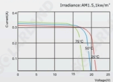
SLP005-12 I-V Curves