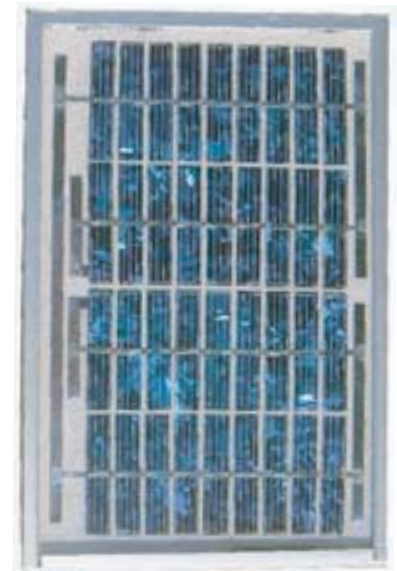
Power Up 2-7 Watt Module