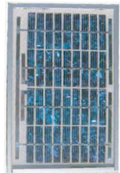
Power Up 2 Watt Module