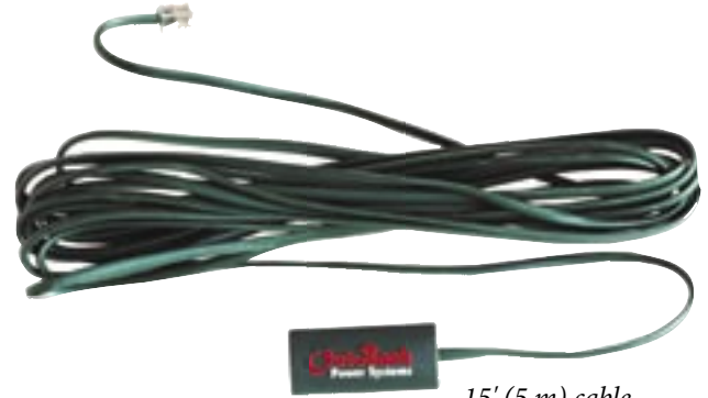
15' (5 m) cable

The OutBack Remote Temperature Sensor (RTS) is a necessary tool for proper battery charging. All OutBack products with integrated battery charging have a temperature compensation system built-in which benefits from the installation of the optional RTS. The RTS ensures that your OutBack system knows the precise ambient temperature so that it can recharge your batteries safely and efficiently. Systems with multiple OutBack products connected to one HUB4 or HUB10 require only a single RTS to be installed.