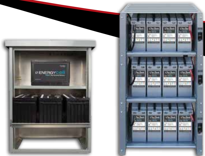
IBE-1 and IBR-3 Enclosures with EnergyCell Nano-Carbon Batteries

The Nano-Carbon is an enhanced and optimized negative active material formulation which makes it more than just a carbon additive. The high surface area carbon is a specially formulated additive for improving the negative active material in lead-acid batteries. Carbon increases conductivity and adds additional capacitance to the battery. Nano-Carbon improves charge efficiency and allows PSoC operation with improved deep discharge recovery.