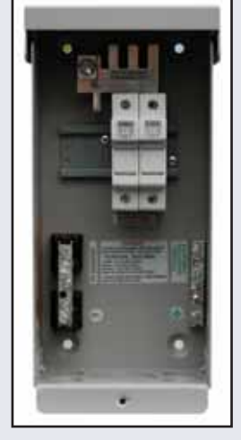
Configured with 2 600 VDC fuses