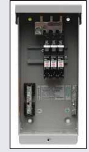
Configured with 3 150 VDC breakers