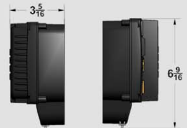
View with wall mount