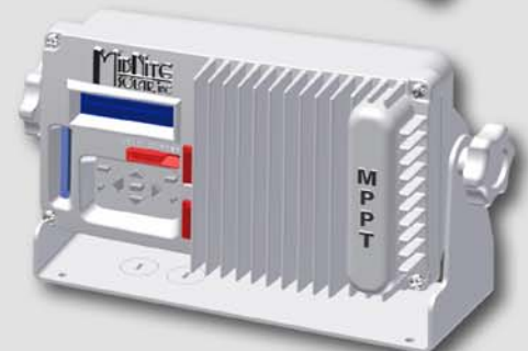
Optional marine version is available in black or white.

The KID's HyperVOC feature allows up to 162VOC. (The KID will not be harmed by voltages between 150 and 162VDC (this is the HyperVOC range). However the KID will remain in standby until the voltage is 150v or below.)