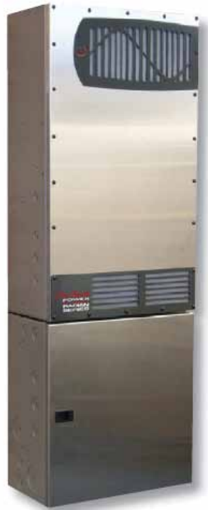
Radian GS8048 & GSLC175-AC-120/240