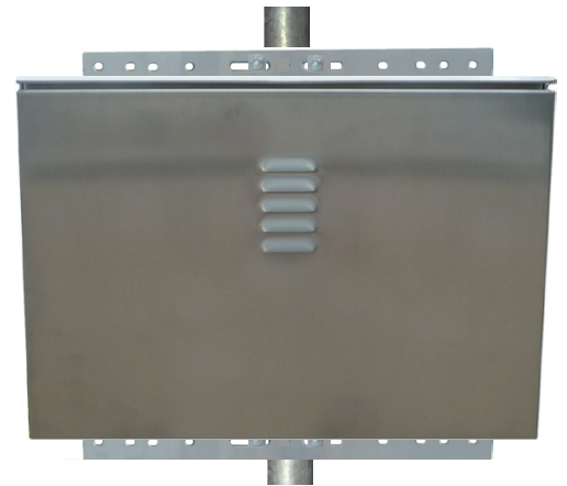
Mounts to 2-3" schedule 40 pole using 2 u-bolts (Bolts not included)