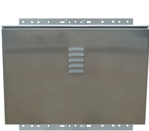
Mounts on wall using 4 lag bolts (Bolts not included)