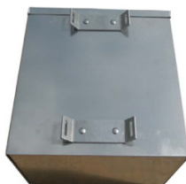
Banding available for unique mounting structures