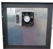
Door fans available in 12V, 24V, and 48V DC/120V AC