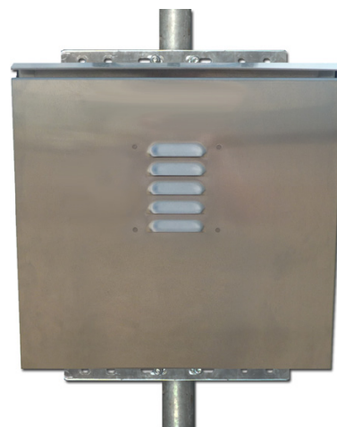
Mounts to 2-3" schedule 40 pole using 2 u-bolts (Bolts not included)