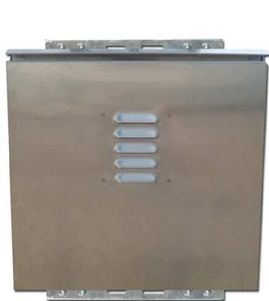
Mounts on wall using 4 lag bolts (Bolts not included)