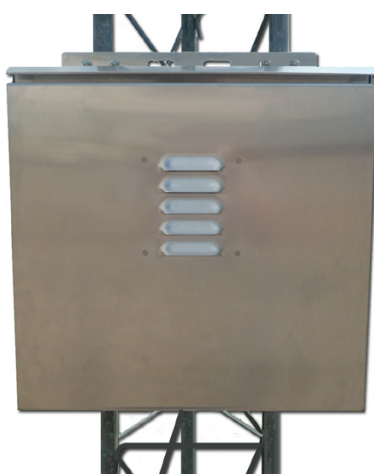
Mounts to Rohn25 tower using 4 u-bolts (Bolts not included)