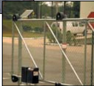
Gate Operator Photo Courtesy of GTO Inc.

UNI-SOLAR framed panels are for permanent, fixed position mounting with optimum tilt, wind resistance and exposure to sunlight. These glass-free, lightweight, unbreakable modules can be utilized in a wide variety of applications from fence charging to telecommunications.