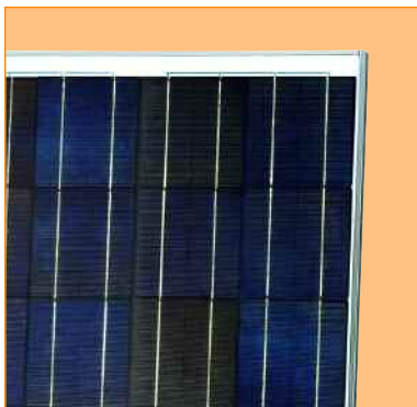
Solder-coated grid results in high fill factor performance under low light conditions.