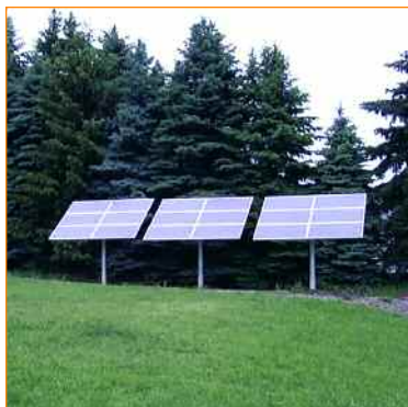
Sharp multi-purpose modules offer industry-leading performance for a variety of applications.