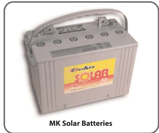
MK Solar Batteries

The Deka Solar Series of valve-regulated, gelled-electrolyte batteries are designed to offer reliable power for renewable energy applications where frequent deep cycles are required and minimum maintenance is desired. These batteries are sealed, but will vent at a pressure of 2 psi while being charged. Therefore, they require a ventilated enclosure to prevent gas build up. Maximum charging voltage should be at least 13.8 volts, but no more than 14.1 volts at 68°F. Two year warranty (One full and one pro-rated). We recommend these batteries for small to medium sized PV systems, from recreational vehicles to remote telecommunication sites.