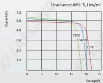
SLP120-12U I-V Curves