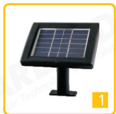
1.5W Solar Panel