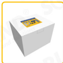
White Box with Label